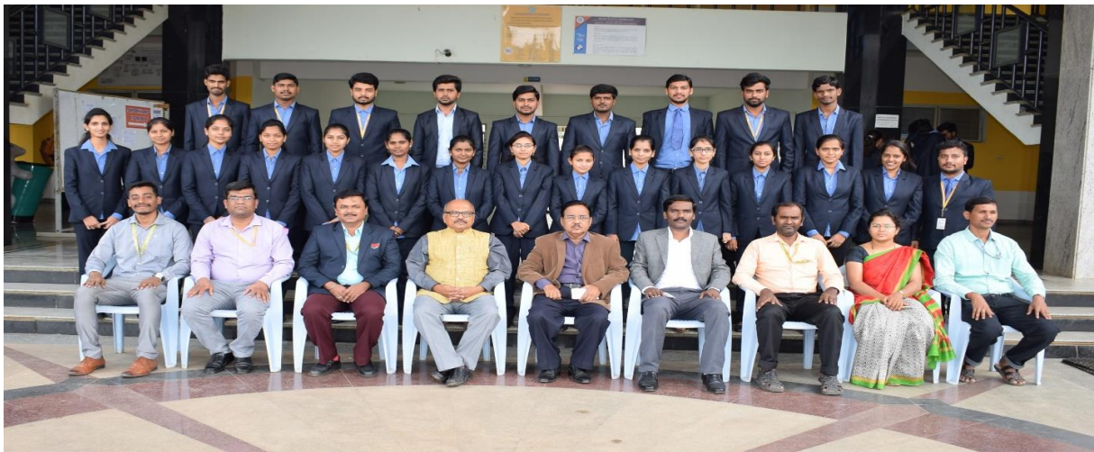
2018 Batch MBA Students: 100 % Placement