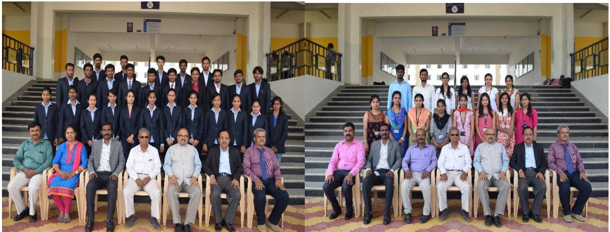
2017 Batch MBA Students: 100 % Placement