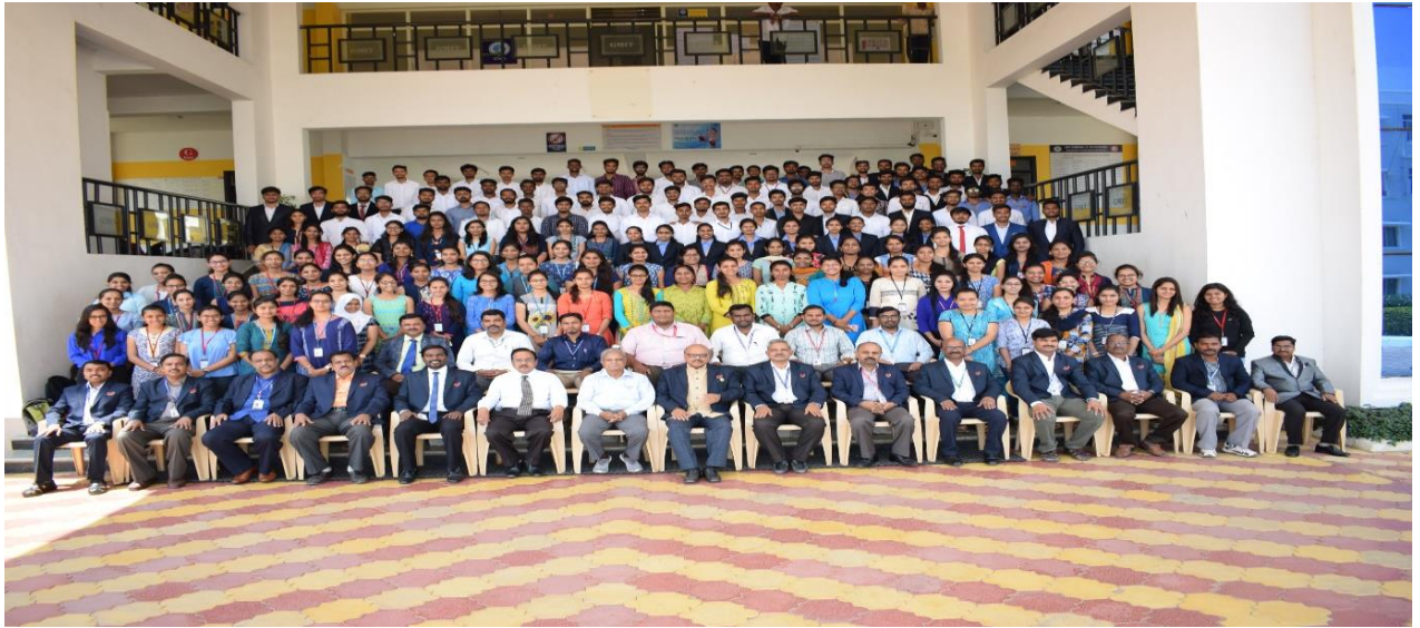
2019 Pass out Batch Students